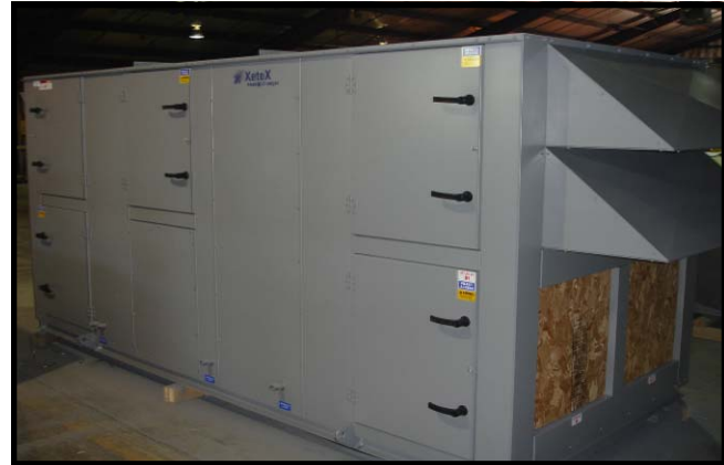
View of the unit from the outdoor air intake hoods.

Like the model DXH, this DXH–XD unit efficiently conditions and dehumidifies supply air—but it recovers even more energy from a forced exhaust airstream, cutting building operating costs even further. The unit shown here is one of six 100% outdoor air handling units on an Elementary School HVAC renovation project. Newly installed heat pumps provide heating and cooling, delivered through a dual purpose water coil in each unit. In cooling mode, the Model XLT aluminum flat plate exchanger pre-cools the outdoor air, reheats it after the coil, and recovers energy from the cold return airstream. In heating mode, the exchanger recovers heat from the warm return air and uses it to preheat the incoming outdoor air.